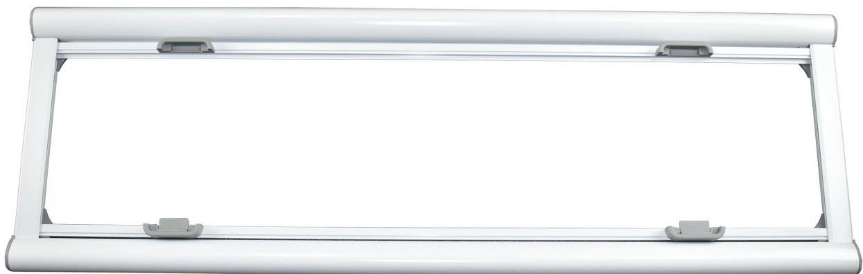
Blind & Screen Assembly for 300x1100 window